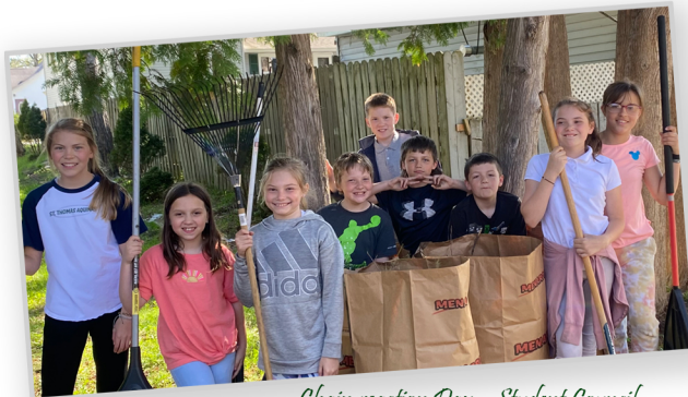
Chain reaction Day - Student Council