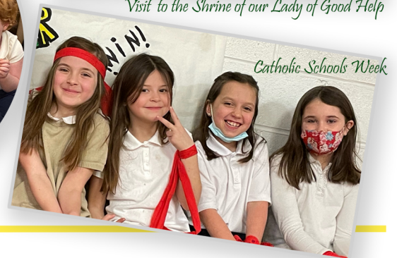
Catholic Schools Week