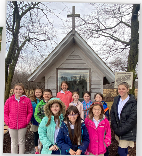
Visit to the Shrine of our Lady of Good Help